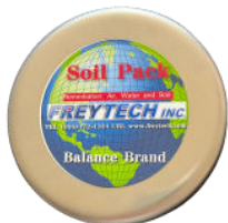
EBD Ground Pack 110 x 110 x 8 mm