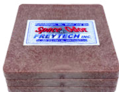
EBD Soil Pack 90 x 16 mm